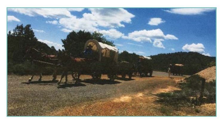
Little Mountain Camp met up with a group that restores old wagons.

The last stop was visiting a newly opened rock and antique shop. The owner, Mary, also lives at the store and shared the history of the building. It was once a restaurant that bootlegged in the 1920s during prohibition. There is an actual working well in the middle of her building, and a secret tunnel in the back that the moonshiners would use to escape the detection of police officers. The daughters enjoyed exploring the past of one of Utah's mining towns and their Camp hopes to be able to explore more sites soon.