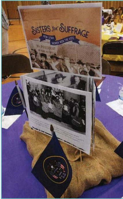
Sisters of Suffrage table decorations.

The Davis Bountiful East Company waited two long years to celebrate the anniversary of the right for women to vote. The result was an epic, fantastic Jubilee with a huge turnout. Our invitations and program were centered around the theme “Soldiers in Petticoats.” Each camp was invited to decorate a table with suffrage themed items and using the colors white, purple, and yellow, which symbolize the suffrage movement. At each place setting there was a bottle of water and a “button.” There were three different suffrage movement images available. They all could wear them showing our sisterly support for the movement. We served a delicious brunch. After the meal, a women’s quartet sang suffrage songs accompanied by a lively pianist, along with a quick but informative PowerPoint presentation about the road to the right for women to vote. The Jubilee ended with a sing-along song where the words to a well-known song were changed to reflect the geographic area. The Daughters laughed and smiled so much at their Jubilee it made the wait worth it.