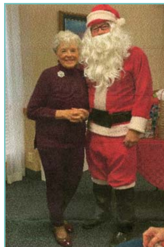
Santa and Mrs. Claus