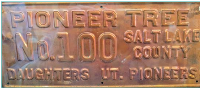
Plaque honoring the trees planted in the Great Salt Lake Valley.

The DUP shifted emphasis from tree markings to tree plantings. Trees were planted on the Utah State Capitol grounds for each DUP President. Individual camps and companies honored trees they planted in parks and on church grounds (with permission).