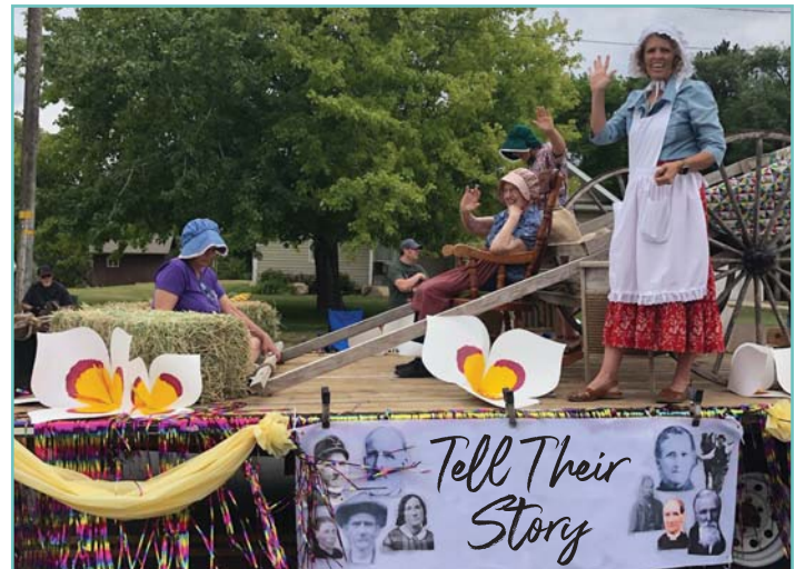
South Weber Camp's parade float.

With summer approaching soon and plenty of time to prepare and plan, consider being part of your community parade celebrating the pioneers. The South Weber Camp made a simple float along with their own homemade signs and entered it into their local parade. Pass along cards were given out alongside of the moving float advertising DUP and how to join. What better way to introduce and pass along the excitement of our pioneer ancestors. At the end, the camp members said "This was fun. Let's do it again next year!" Outreach is wonderful!