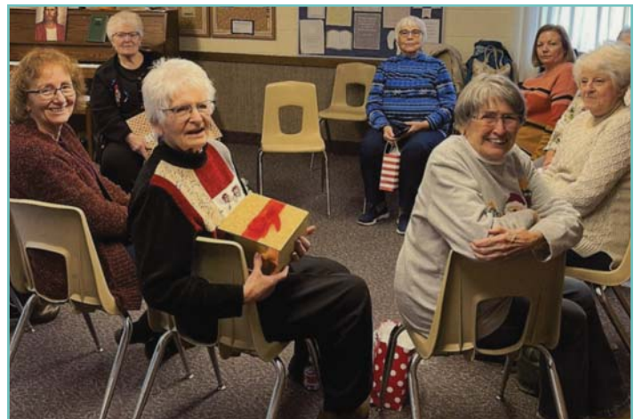
Indian Paintbrush Camp Daughters enjoy their Christmas party.

The Indian Paintbrush Camp , Minidoka Company, Rupert, Idaho, met on December 12, 2022, for their annual Christmas Meeting and Party. Out of 16 active daughters, 12 were in attendance. The day consisted of a regular meeting and lesson presentation, followed by a baked potato bar and custom-made cupcakes. Members then participated in a gifting game where one member read the story called "The Two Gifts." On the words "Snowy" and "Hungry" in the story, everyone passed a gift to either the left or the right. At the end of the story, whatever gift had stopped at your chair was yours to keep. The Board chose and presented to each daughter the 175-year pin from the ISDUP. Everyone enjoyed the day's activities.