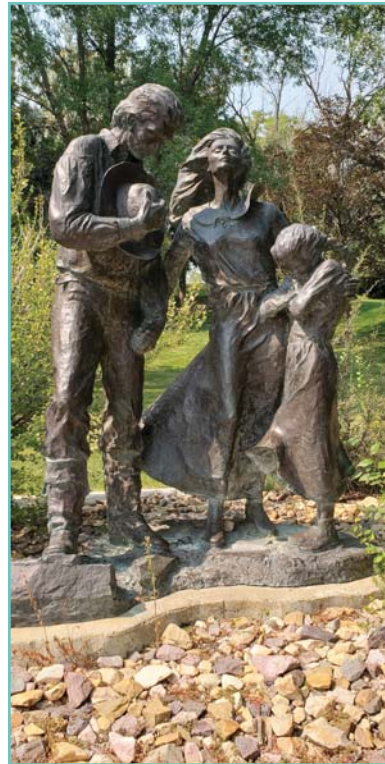
"Pioneer Family: An Everlasting Heritage" Statue

This statue of a pioneer family was on display for many years at the Kanesville Tabernacle and Visitors Center in Council Bluffs, Iowa. Due to the recent updates at the