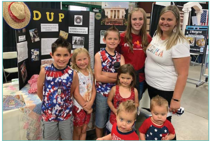
Visitors at the “Remember 9/11” ISDUP Booth