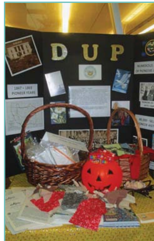
Our DUP display at Friends of Millcreek Senior Center Fall Boutique