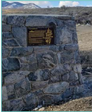
Marker #433 "Porterville"