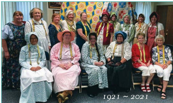
Daughters in John Pack Camp celebrate their 100th Year Anniversary