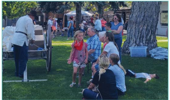
Community members enjoy one of the activity stations at Utah Timp Valley Company's 24th of July Celebration.