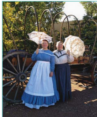
DUP Daughters participate in Nevadaween Celebration

Clark Centennial Hills, Clark Desert Springs and Clark Legacy Meadows Companies of Southern Nevada, participated in the annual celebration of “Nevadaween.” This