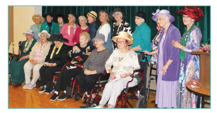
Washington West Company Jubilee.

The hats were judged and prizes given for the most beautiful, outrageous, useful, and creative designs. Each of those in attendance enjoyed the candy-filled favors in the design of Sunday hats. The Snow Canyon Camp hosted the event and served several different kinds of soups with rolls, butter, and Texas sheet cake.