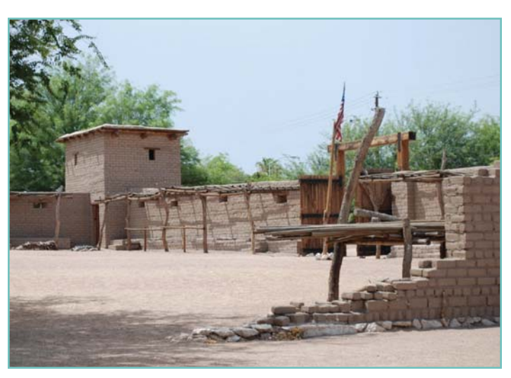
The Old Las Vegas Mormon Fort.

The DUP Companies in Las Vegas, Nevada, will co-host the 170th anniversary celebration of the Las Vegas Mission and Fort. The event will take place at the Old Las Vegas Mormon Fort State Historic Park on June 14, 2025. Previous generations of daughters fought valiantly to save the adobe fort remnant and placed two monuments on the property. The Las Vegas Companies continue to support the history of the Las Vegas missionaries who arrived in 1855.