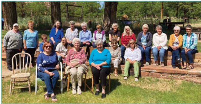
Willow Camp Daughters in Moccasin, Arizona.

They concluded the field trip at the church pavilion where they enjoyed a picnic lunch provided by the board. It was a beautiful spring day and a wonderful time was had by all.