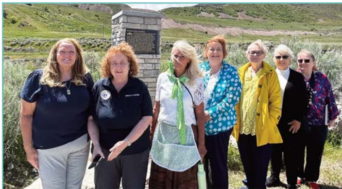
Salt Lake West Company board members at the Pleasant Green Cemetery marker dedication.

Because the roads are not paved and parking is limited at the cemetery, a unique solution was provided for the dedication. On Saturday, May 4, ISDUP board members, dignitaries from Magna City, Company board members, and a Color Guard were present for a videotaping of the dedicatory proceedings. On Monday, the DUP District Convention was held at the Pleasant Green ward building, and the Saturday activities were shown on screen to the full Company. Daughters who had relatives at the cemetery brought historical items for display, and everyone enjoyed breads, jams, and good company.