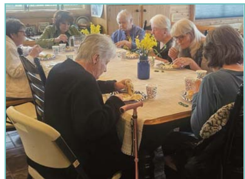
Gunnison Camp Daughters enjoy lunch.