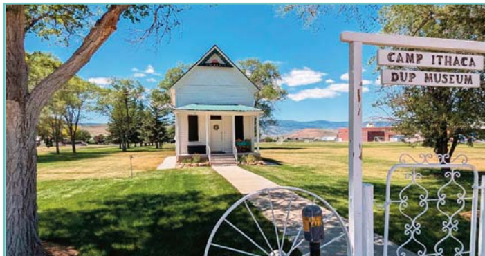
Ithaca Camp DUP Museum

Ithaca Camp , Rich Company, held their annual bake sale as part of Laketown, Utah, Pioneer Day Breakfast. The bake sale helps the camp raise money to cover the cost of projects such as painting their historic DUP museum and doing minor repairs and upkeep. Pies, cakes, cookies, breads, and homemade items donated by Camp members help make the fundraiser a success.