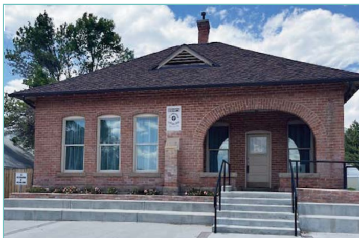
Fountain Green DUP Museum

During the heavy winter snows of 2022-2023 part of the roof had fallen and severe damage was sustained in the Museum. Yvonne Hansen, Museum Director and Camp Captain, acted quickly when she received word from the Fire Marshall by gathering vinyl tablecloths and covering the artifacts to prevent damage. With the help of the city and many contributors, all the artifacts were moved and inventoried. Then the work to replace the roof and repair the damage was undertaken. In the process, many improvements were also made. With the help of many people, the Daughters were grateful to celebrate the completion and reopening of the museum as part of their 2024 Jubilee. They invite visitors to come and enjoy the new museum.