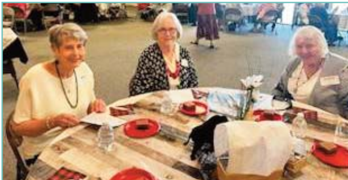
Daughters enjoy lunch at the Salt Lake Olympus Company Jubilee.