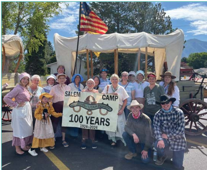
Salem Camp Daughters and guests celebrate the Camp's 100 Year Anniversary at the Salem Days Parade.

Those present were invited to tour the log cabin museum afterwards. This little cabin was used as Salem's first post office in 1872 and has been under the care of Salem Camp since 1938. It is now located at Heritage Park, on the banks of Salem Pond, along with the school bell, old fort and tree monuments. The celebration will continue each month with a "camp history moment" at meetings this year.