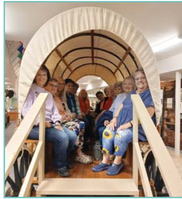
Majestic Teton Mountain Camp at Teton Valley Museum.

In preparation for the October lesson, "The Tetons, Jackson Hole and Mormon Row" the Majestic Teton Mountain Camp , Madison Company in Teton, Idaho, visited the Teton Valley Museum in Driggs, Idaho. While there they saw the John Colter stone pictured in the October lesson and learned about the settling of the Teton Valley and Mormon Row. They viewed artifacts and history about the mountain men