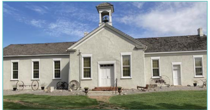
Old Bell School Museum.