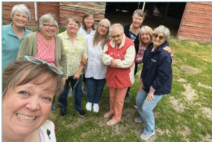
Members of William B. Preston Camp at Benson Family Farm.