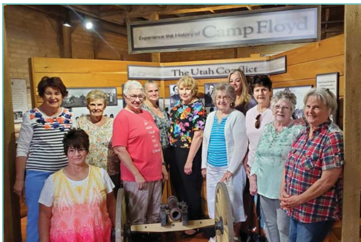
Members of Emma J. Atkin Camp at the Camp Floyd Commissary.

Emma J. Atkin Camp , Tooele Company in Tooele, Utah, toured Camp Floyd State Park for their 2024-2025 year opening social. At the Museum/Commissary, members were greeted by a docent in military period dress who gave the history of Johnston's Army and Camp Floyd. A visit to both the Museum and Stage Coach Inn, complete with period furnishings and artifacts, was amazing. Lunch was enjoyed on this beautiful afternoon on the green behind the Inn. Members toured the District School erected in 1898. Memories were recalled as they sat at desks that were similar to those from their own childhood. They also stopped briefly at the cemetery, where many unknown soldiers are buried.