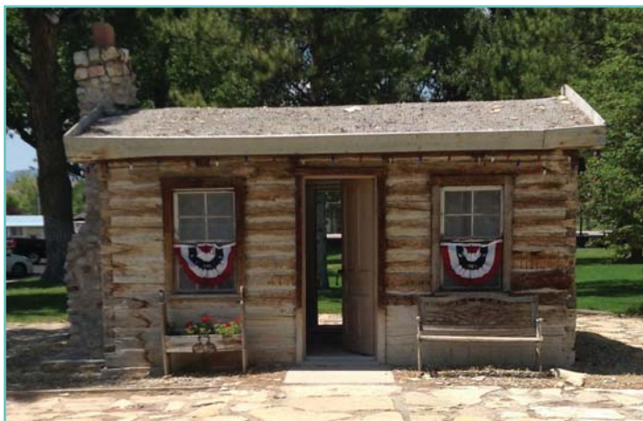
John A. Johnson Cabin.