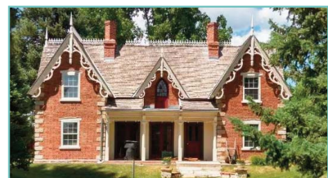
John Watkins Home, 2018