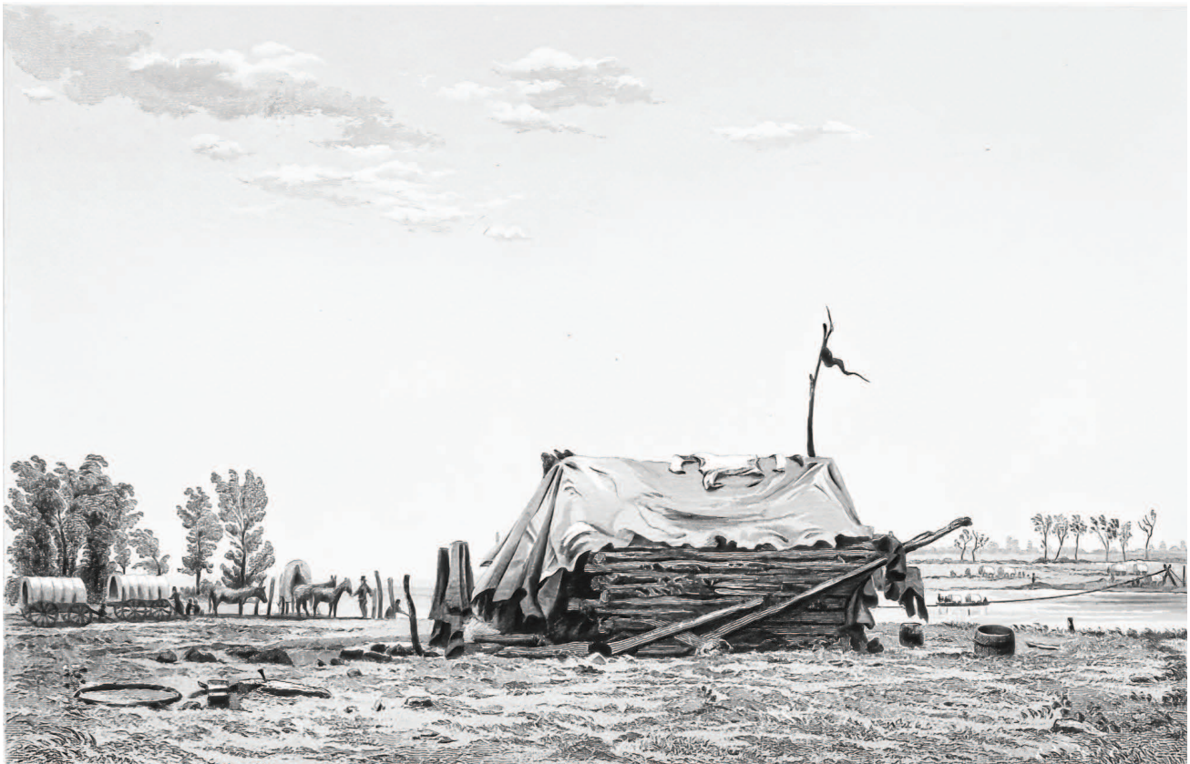
Loup Fork Ferry.