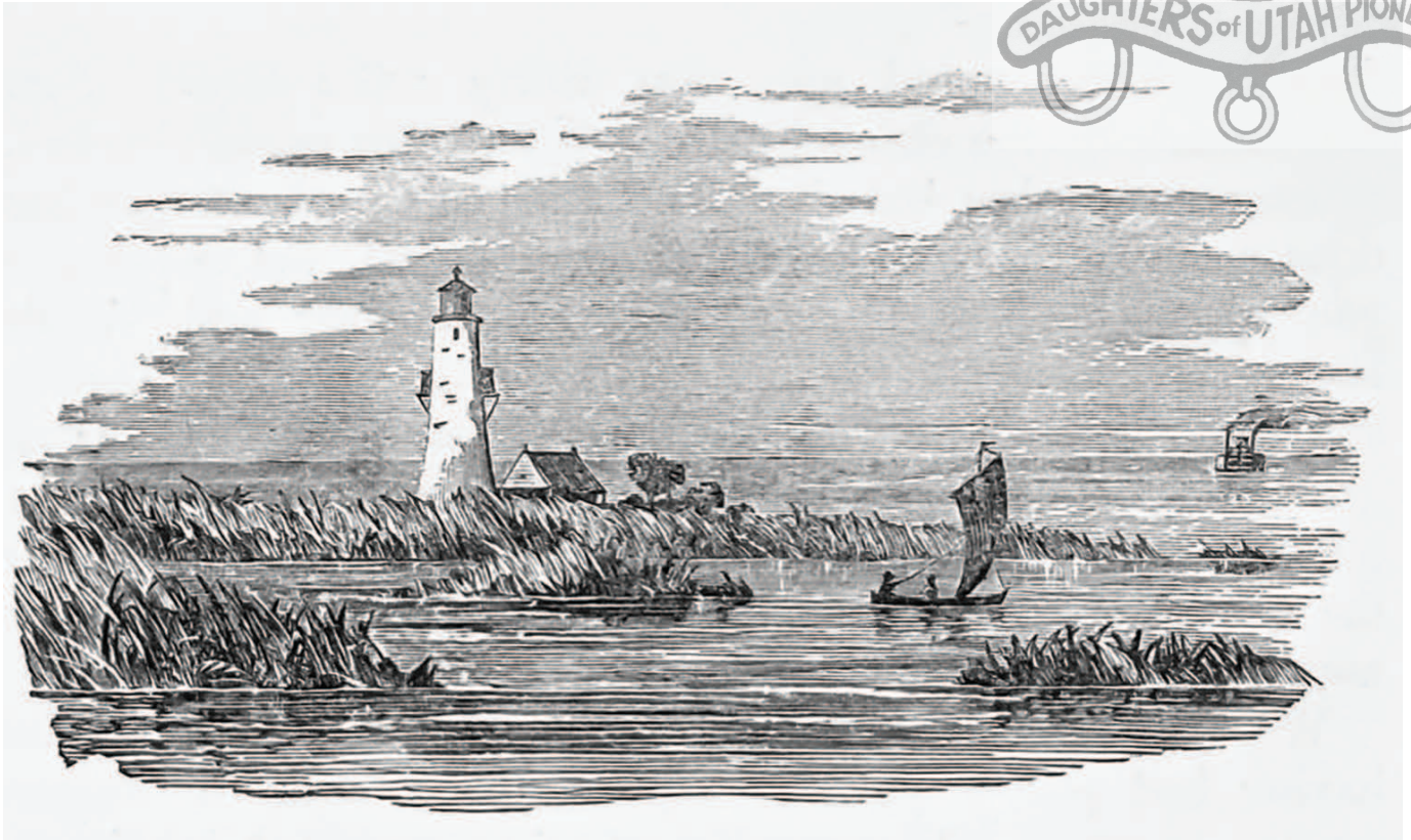
Lighthouse on the Mississippi.