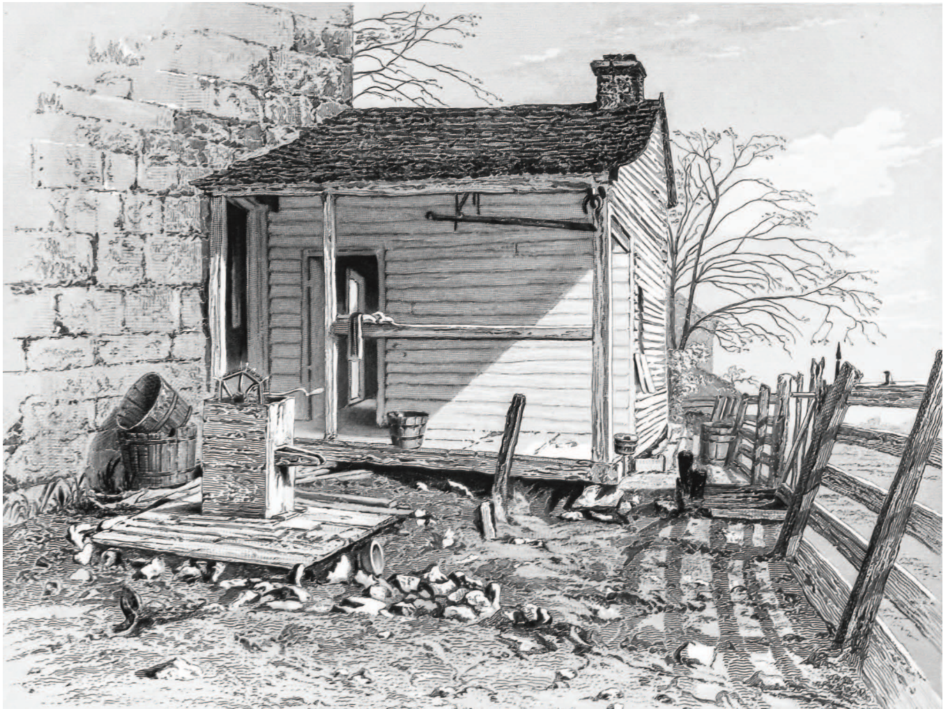
Well at Carthage Jail.