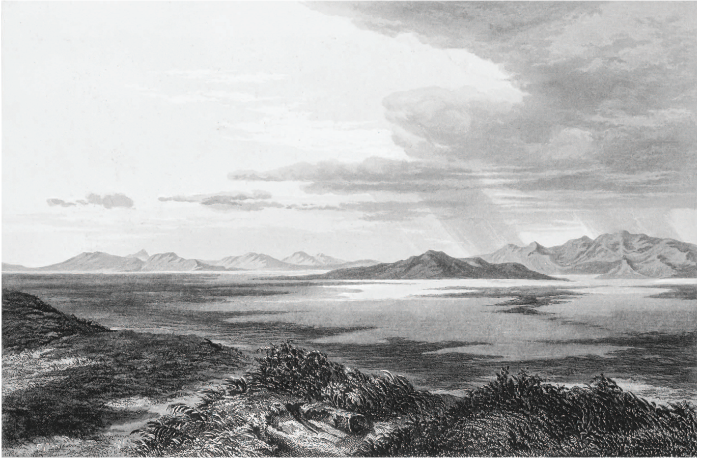
Great Salt Lake.