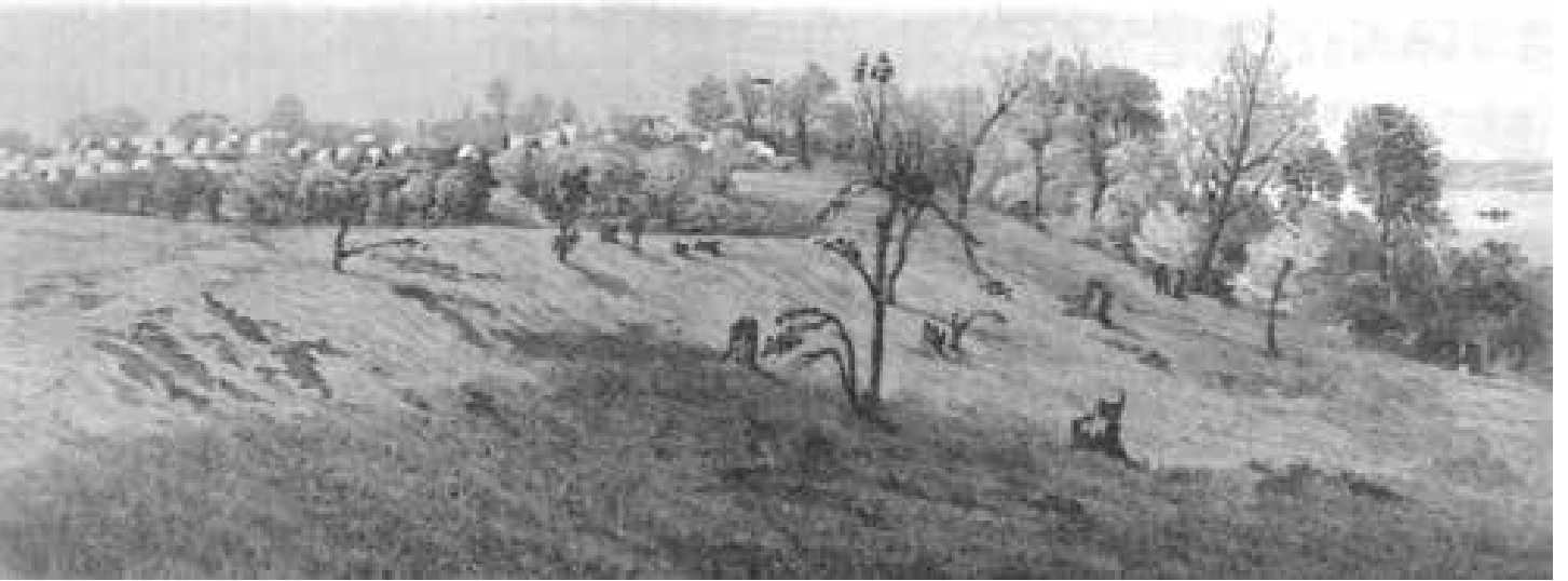
Nauvoo from the river.