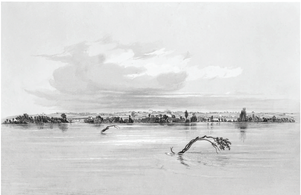
Camp at Keokuk.