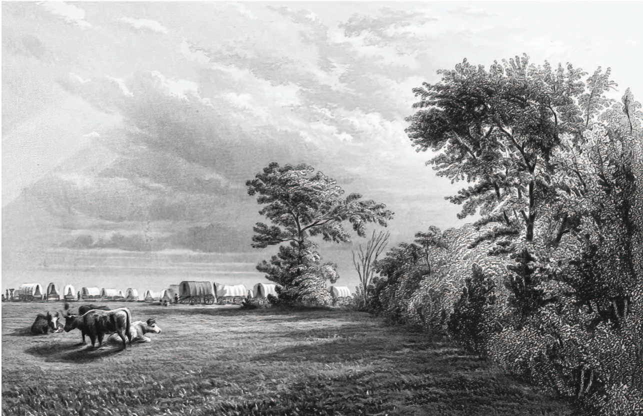
Camp at Wood River.