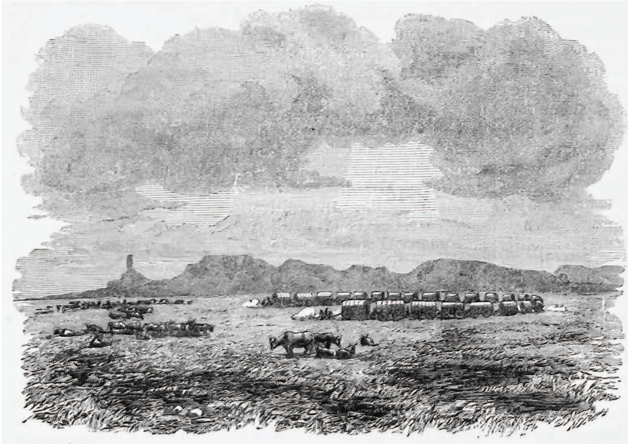
Chimney Rock with wagons.