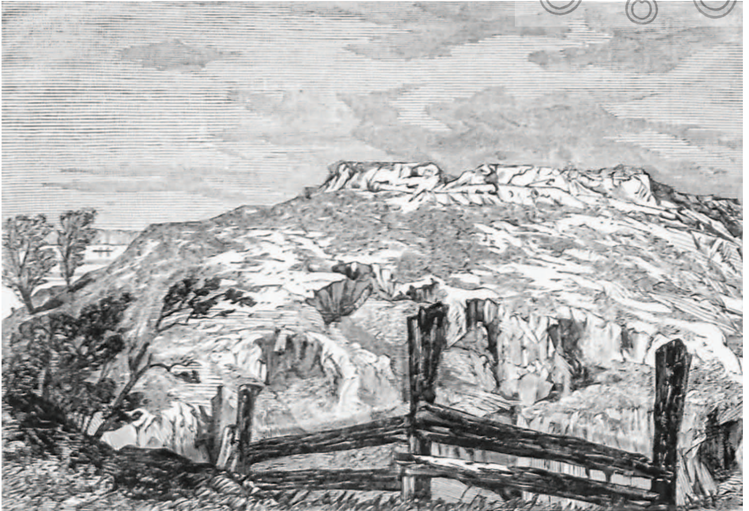
Old Fort Rosalie.