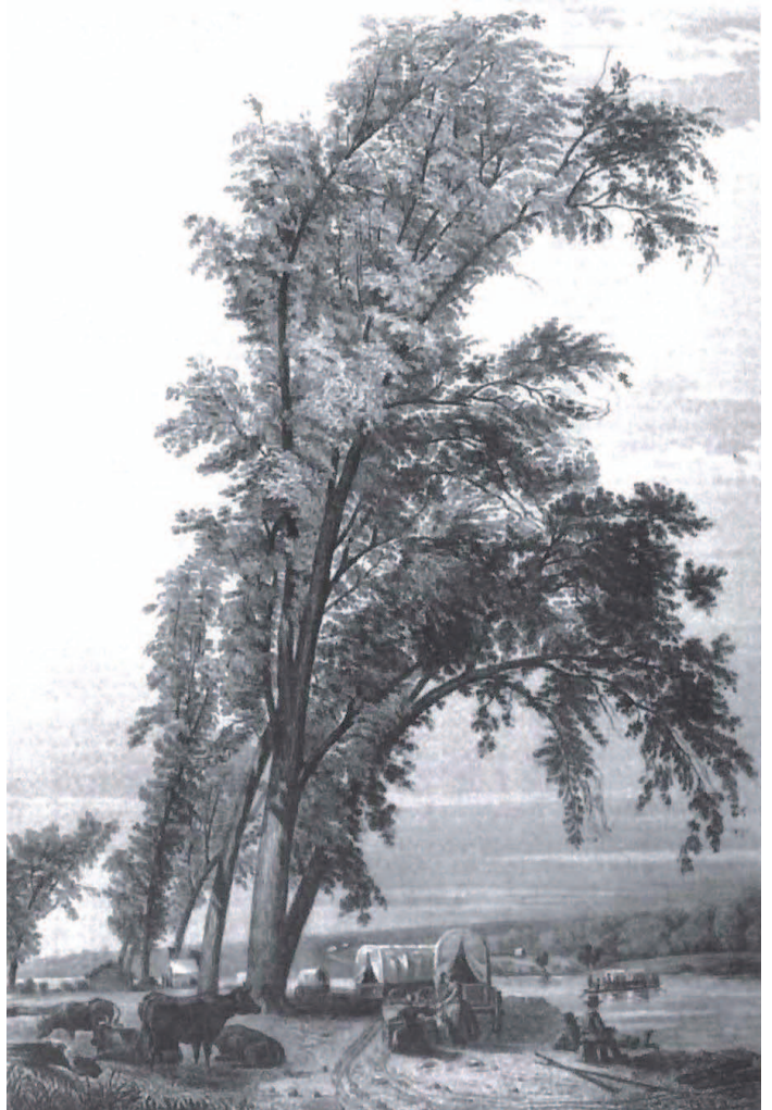
Council Bluffs Ferry.