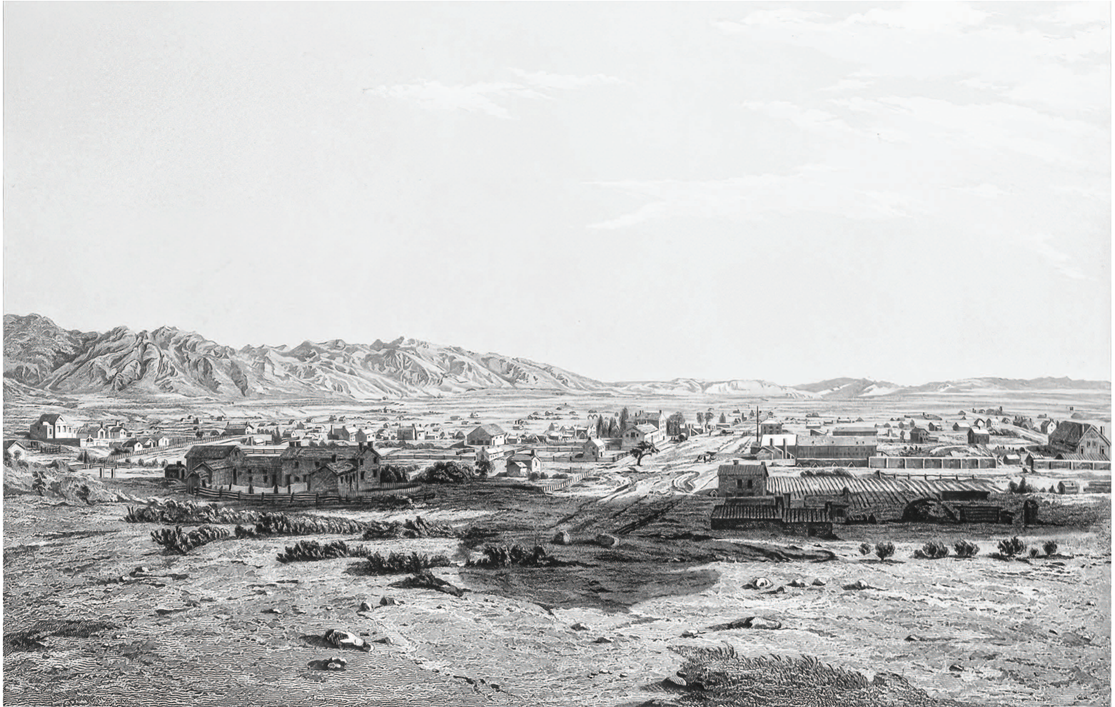
Great Salt Lake City in 1853.