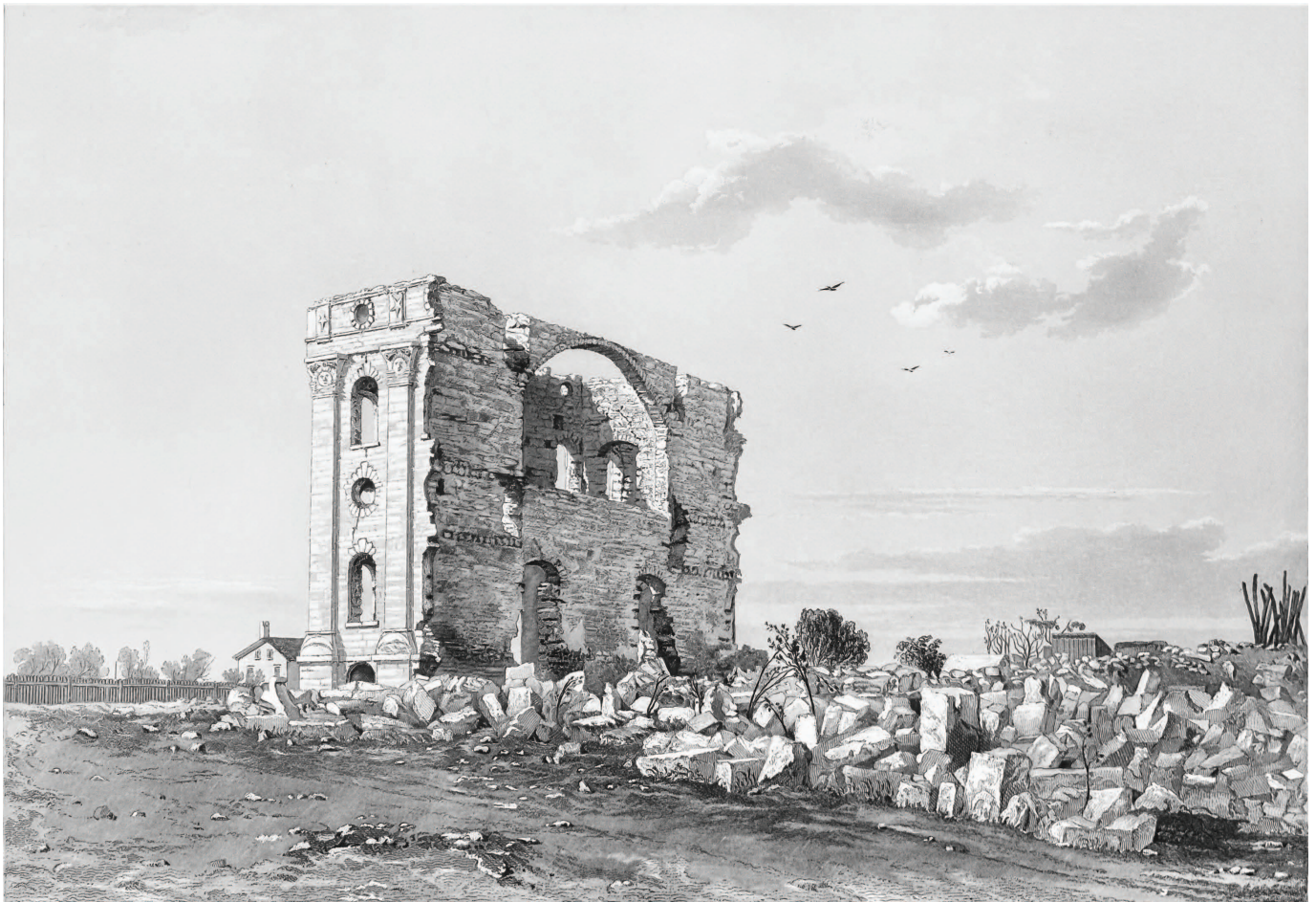
Nauvoo Temple ruins.