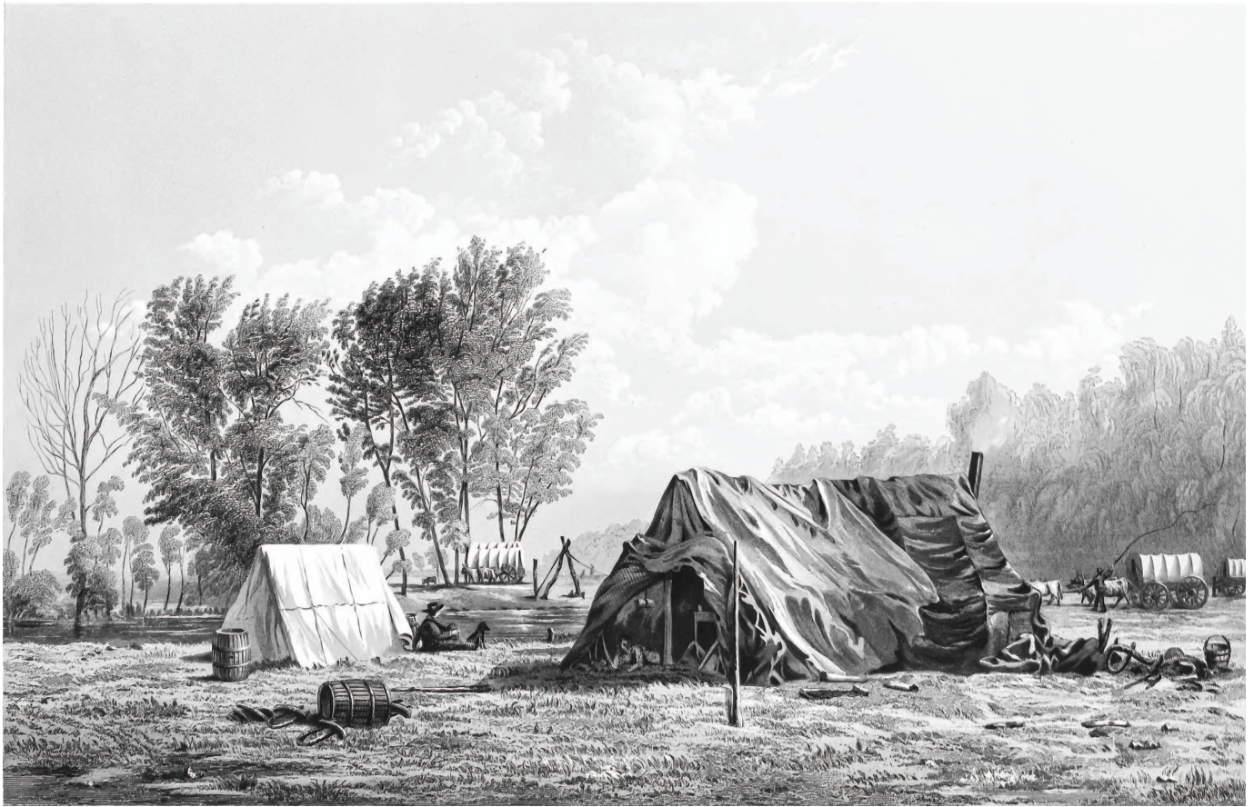
Elk Horn River Ferry.