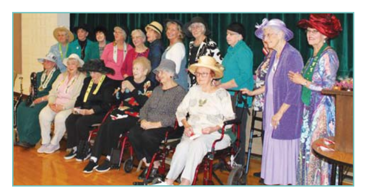
Washington West Company Jubilee.

The hats were judged and prizes given for the most beautiful, outrageous, useful, and creative designs. Each of those in attendance enjoyed the candy-filled favors in the design of Sunday hats. The Snow Canyon Camp hosted the event and served several different kinds of soups with rolls, butter, and Texas sheet cake.