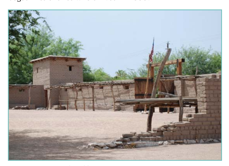
The Old Las Vegas Mormon Fort.

The DUP Companies in Las Vegas, Nevada, will co-host the 170th anniversary celebration of the Las Vegas Mission and Fort. The event will take place at the Old Las Vegas Mormon Fort State Historic Park on June 14, 2025. Previous generations of daughters fought valiantly to save the adobe fort remnant and placed two monuments on the property. The Las Vegas Companies continue to support the history of the Las Vegas missionaries who arrived in 1855.