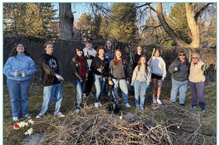
Members of Cottonwood Heights Youth City Council.

The students talked about teamwork; they saw what needed to be done and got to work. All the debris was bagged and removed from the site. They did a professional job, and the Salt Lake Far South East Company praises the council members for their service and dedication.