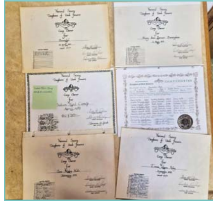
Camp Charters from Davis Bountiful East Company.