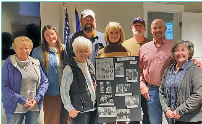
Martin Harris Camp members with Clarkston Town Council.