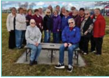
Malheur Company and Gate City Camp revitalized DUP benches.